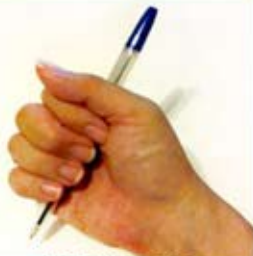
FISTED GRIP 1-2 years old

Children often hold their writing tool like a dagger, scribbling using their whole arm.