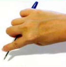
DIGITAL PRONATE GRIP 2-3 years old

All fingers are holding the writing tool but the wrist is turned so that the palm is facing down towards the page. Movement now comes mostly from the elbow. Children should start being able to copy a horizontal, vertical and circular line.