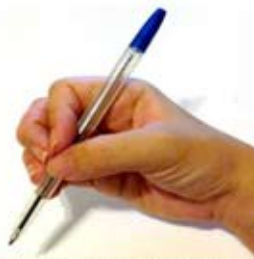
STATIC TRIPOD GRIP 4-6 years old

4 fingers are held on the writing tool. Movement is mostly from the wrist and the hand and fingers move as one.