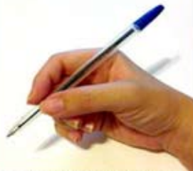
DYNAMIC TRIPOD GRIP By 6 or 7 years old

This is a 3 finger grasp, where the thumb, index finger and middle finger work as one unit.